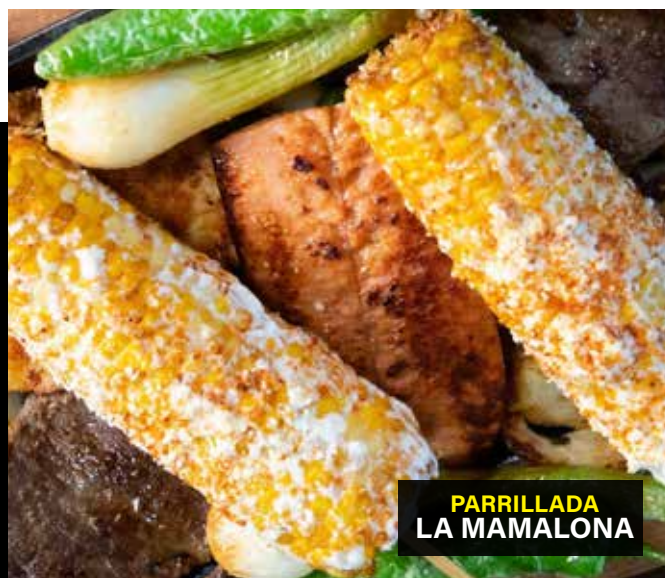
PARRILLADA LA MAMALONA

16 oz. bone in rib-eye steak with grilled shrimp on a bed of grilled peppers and onions. Served with rice, lettuce, avocado, pico de gallo, jalapeño and lime – 35.00