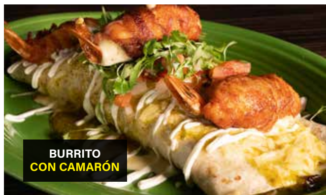
BURRITO CON CAMARÓN