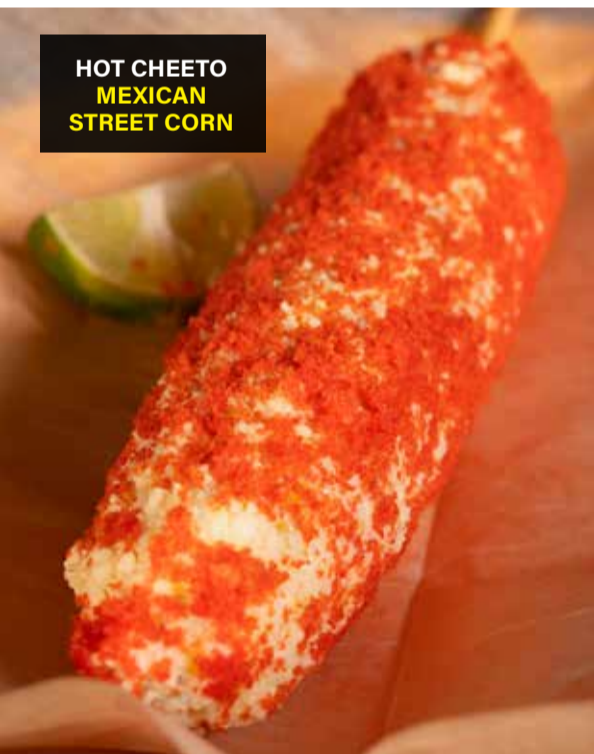
HOT CHEETO MEXICAN STREET CORN