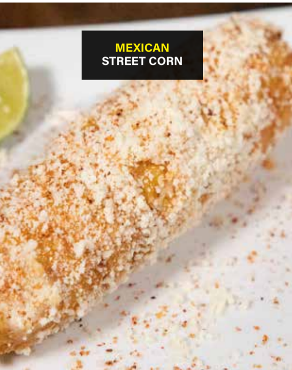
MEXICAN STREET CORN

Lightly breaded shrimp on our hot buffalo sauce – 13.50